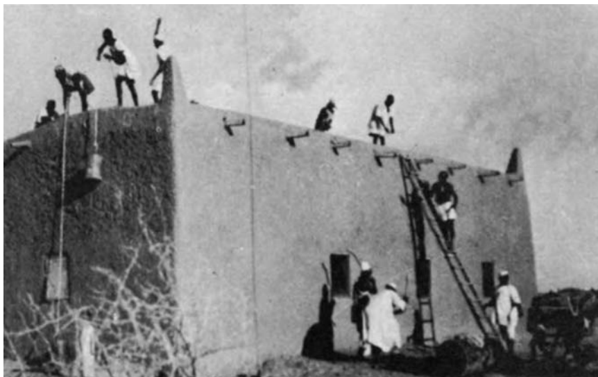
Building the church in Tsibiri.

For these Christians, the local French administration acted as intermediary to protect the rights of Christians against the claims of intrusive Muslims.