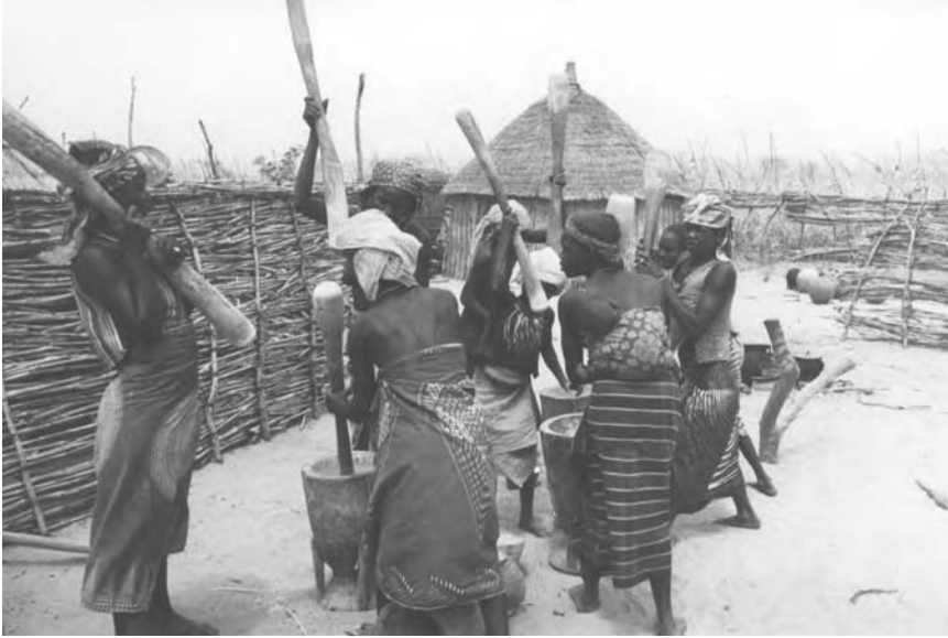
“Women of the Bible school, preparing food outside.” Courtesy of SIMIA (NR 150), photographed by Genevieve Swanson, 1983.

male) described this experience as an occasion for the formation of a sense of esprit de corps . Whatever the strengths and weaknesses of SIM’s network of Bible schools, all of the major leaders of the evangelical churches in Niger (there are now four competing associations of churches) went through it. Thus, the Bible schools served not only as sites for training evangelists; they were central to determining who would become pastors and ultimately who could become a leader within the evangelical community. The students came from different regions of the country, their class backgrounds conflicted in the larger society, and the ethnic groups they represented had sometimes been at war with each other in the past. These tensions and competition between students were eventually played out in the fragmentation of the evangelical churches into numerous different associations at the national level. Rather than becoming a force for Christian solidarity, Bible school graduates fed into existing tensions and contributed to the remarkably fractured character of the evangelical churches today.