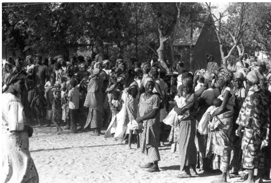
“Women line up with their children as they wait to gather their rations of grain.” Courtesy of SIMIA (NR 203), photographed by Tony Rinaudo, 1985.

earn the right to a 50 percent subsidy in grain purchases rather than a direct grain allocation (Rinaudo 1997a). SIM’s various development activities were dubbed the “Maradi Integrated Development Project,” or MIDP, and were gradually expanded to include many villages in the region. In some ways, the government-mandated need for a food-for-work dimension to the distribution of relief food drove the project in its early years, and various components were added with little overarching philosophy to guide staff in its increasing engagement with development.