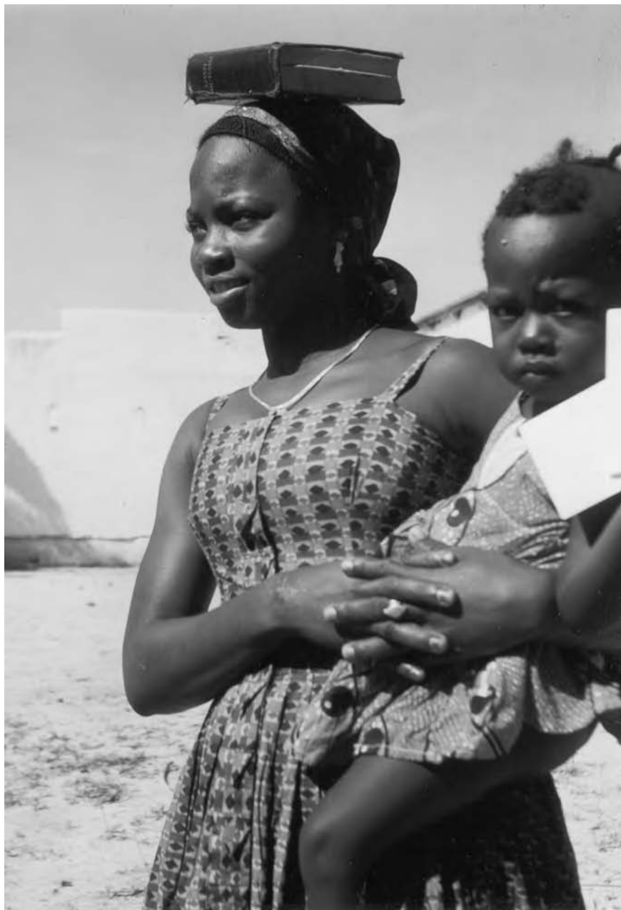
Maradi woman on the way to church.