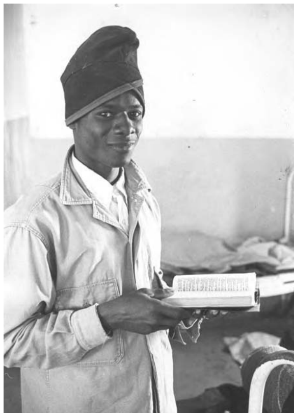
“Evangelist at Galmi Hospital.”