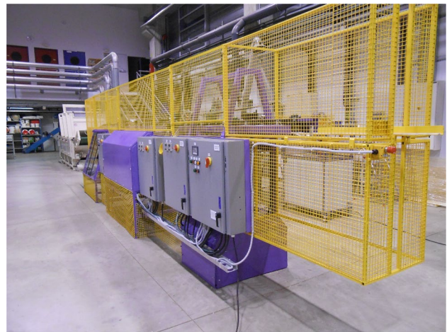
Fig. 1 Taproot fibre extraction device

The scutching hackling fibre extraction device is composed of 3 distinct modules. The first module consists of three successive pairs of fluted rollers designed to break the woody part of the stems. The material obtained at